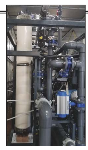
Figure 7. Ultrafiltration