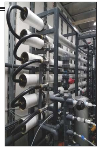
Figure 8. Reverse Osmosis